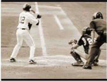
American Legion Baseball

It's not just who we are, It's what we do!