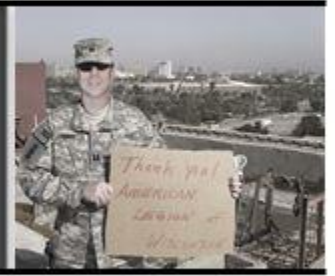
Troop & Family Support